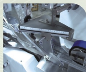
Adjustable Bag Former