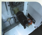
Heavy-duty Servo System