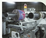
Double Film Holder