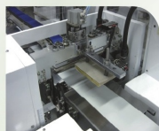
Box-motion End Sealer